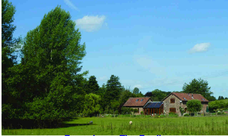
Frogs Leap, The Fording

5. Go straight ahead in the field and over a stile near the stream into the next field. Continue close to the stream on the left and then bear right onto a grassy field track with way marker post on your left and then through a field gate onto a lane. Go left and then quickly right through a field gate on the other side of the kennels. Cross the field to a stile in the far right hand corner and then continue with the stream on your left, with views to your left uphill to Linton Ridge. Leave the field through a field gate onto a road. Go left for about 150 m and, where the road goes left, go straight ahead for another 100m on a minor road, having the charming name of Cut Throat Lane.